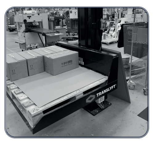
The slim design makes it easy to work besides the TSL pallet lifter and work in the most ergonomic height.