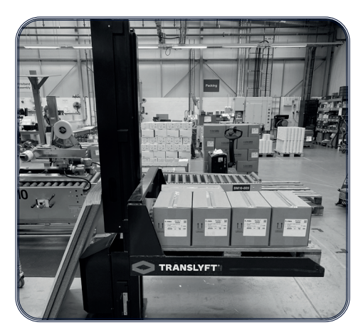
Translyft TSL pallet lifters are ideal for use in compensation for differences in work levels, in particular when used with palletized loads.

Find more information at www.translyft.co.uk